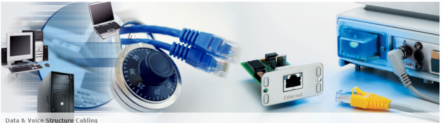
Data & Voice Structure Cabling